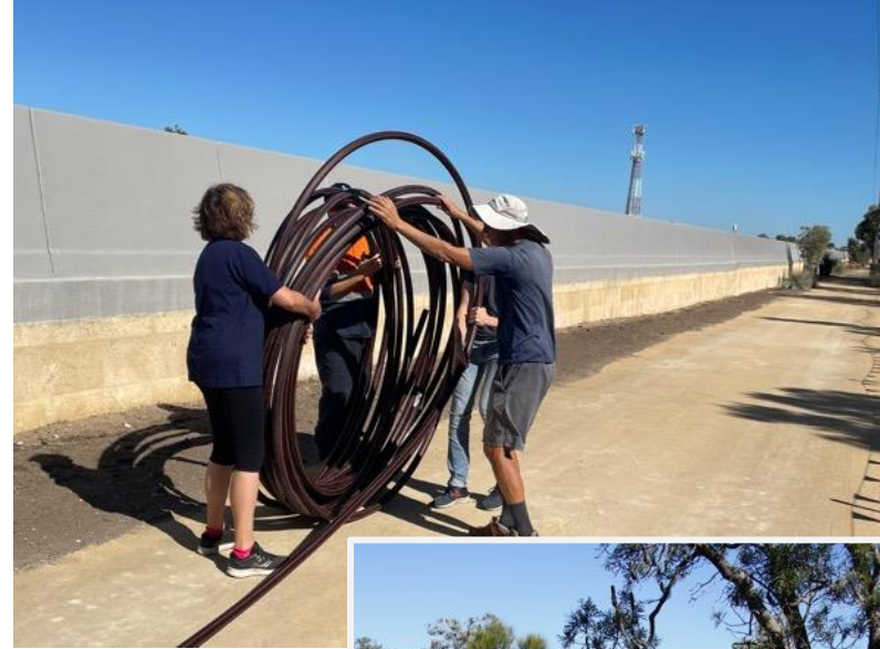
Deploying irrigation pipework at Ken Hurst Park