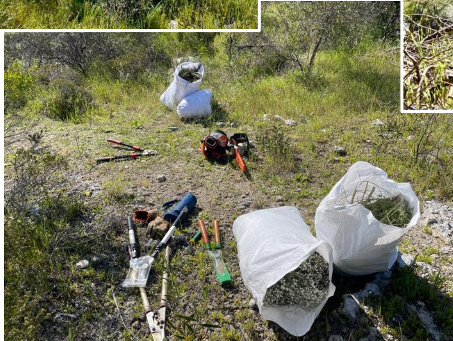
White Weeping Broom Retama raetam