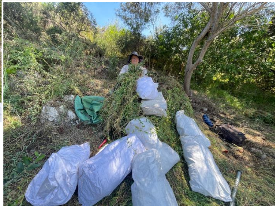
Tangier Pea Lathyrus tingitanus