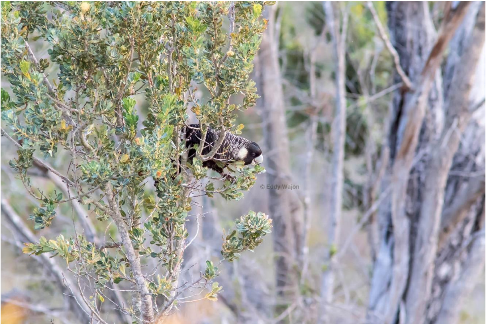
Carnaby's Cockatoo feeding on Banksia ( Dryandra ) sessilis